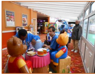
Glimpse of the annual holiday trips