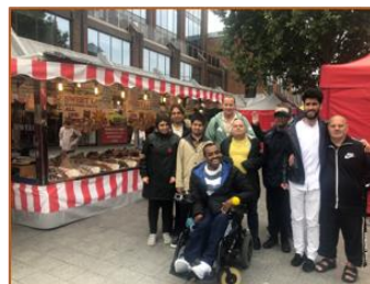
Participation in various community and charity events