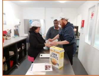
Launch of Seva Education and our high street cafe